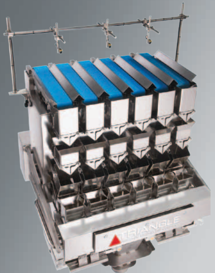
Triangle Fresh Protein Weigher